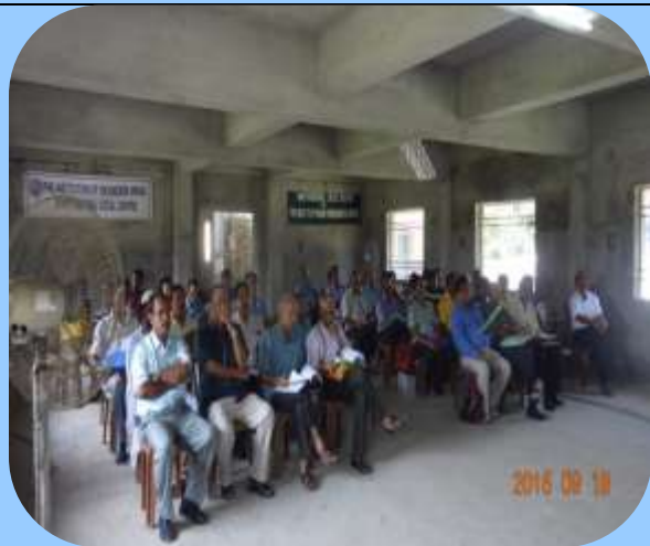
Title of Photo : A.G.M. is going on