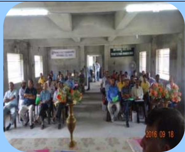
Title of Photo : A.G.M. is going on