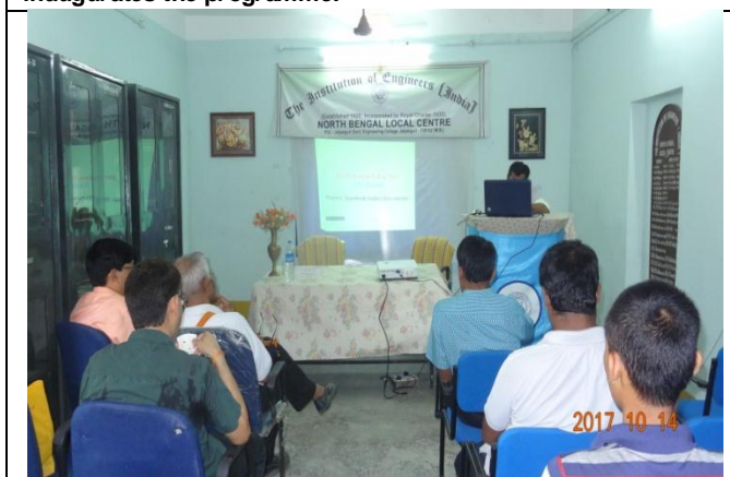
Title of photo: Programme is going on.